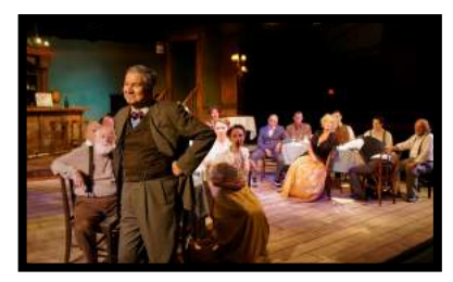
Ensemble's critically acclaimed 2013 production of The Iceman Cometh

Email: celeste@ensemble-theatre.org or call 216-321-2930