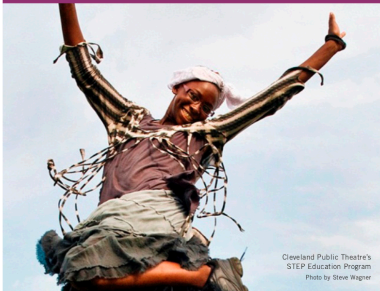
Cleveland Public Theatre's STEP Education Program

... WITH INVESTMENT BY CUYAHOGA ARTS & CULTURE