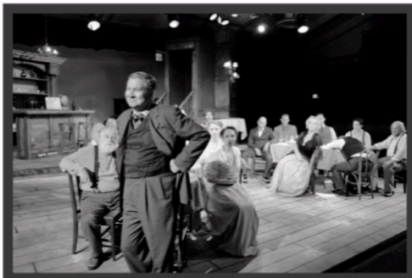
Ensemble's critically acclaimed 2013 production of The Iceman Cometh