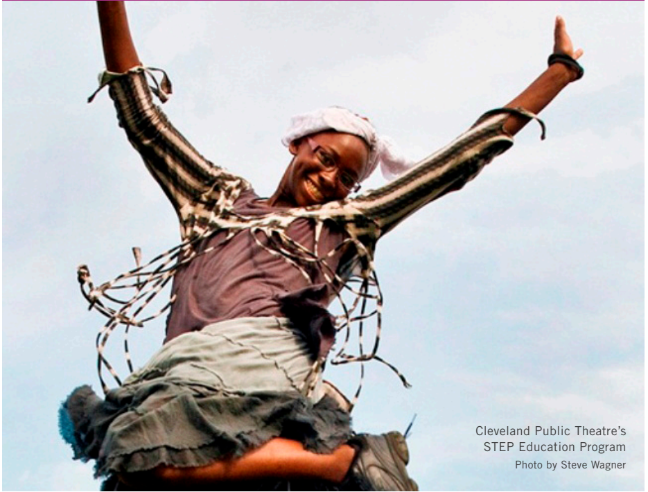
Cleveland Public Theatre's STEP Education Program