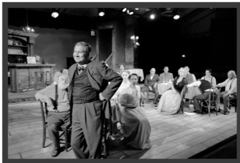
Ensemble's critically acclaimed 2013 production of The Iceman Cometh